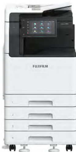
FUJIFILM Business Innovation (A3/Color) Apeos C3067