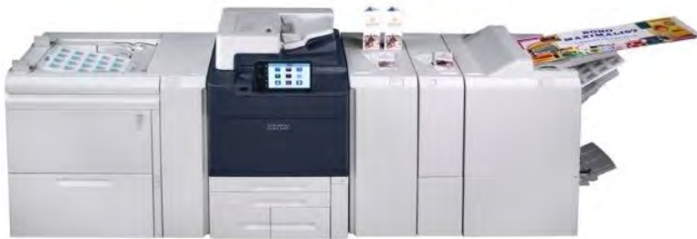
Xerox (A3/Color) PrimeLink C9200 series