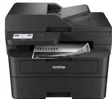
Brother Industries US (A4/Monochrome) MFC-L2900DW