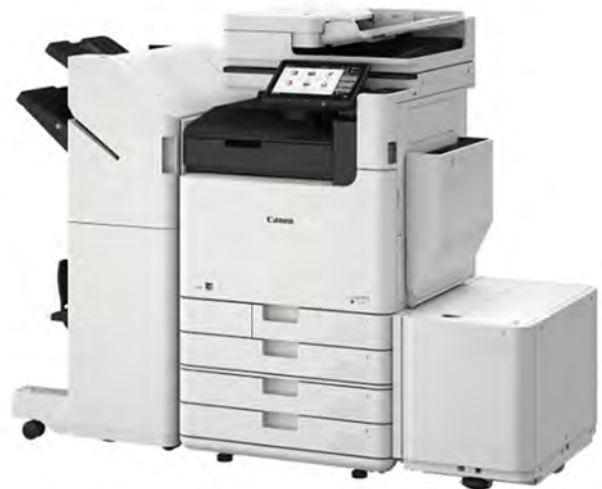
Canon (A3/Color) imageFORCE C7165F