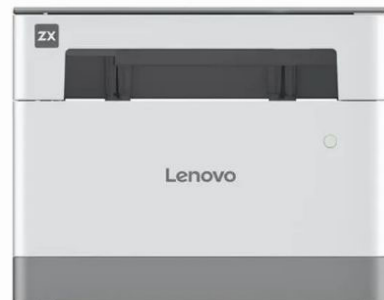
Lenovo China (A4/Monochrome) Elephant