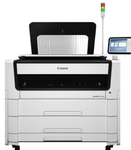
Canon (A0/Monochrome) plotWAVE T55/T50