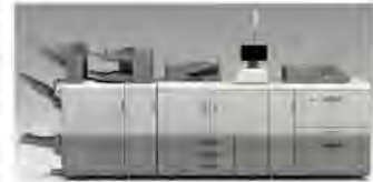
RICOH Pro 8420S