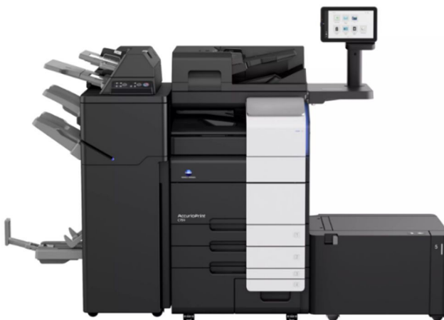
Konica Minolta Europe (A3+/Color) AccurioPrint C751i