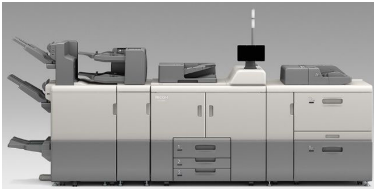
Ricoh (A3+/Monochrome) RICOH Pro 8420S