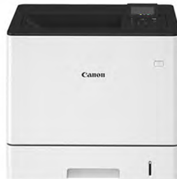
Canon Asia Pacific (A4/Color) imageCLASS LBP732Cx