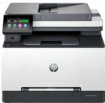
HP (A4/Color) Color LaserJet Pro 3301fdw