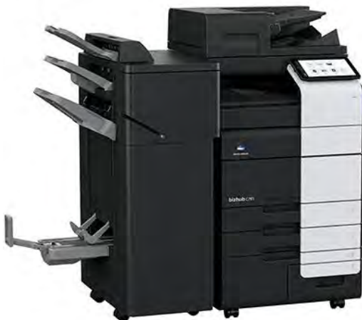
Konica Minolta (A3/Color) bizhub C751i