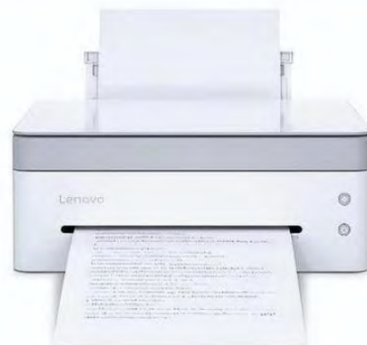
Lenovo China (A4/Monochrome) Panda Pro