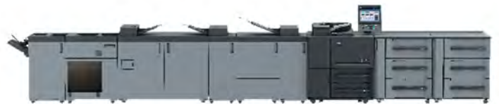
Konica Minolta China (A3+/Monochrome) AccurioPress 7136