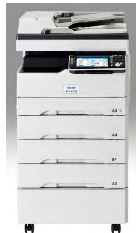
Muratec (A3/Monochrome) MFX-8239