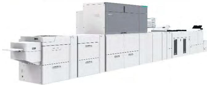
Sharp US (A3+/Color) BP-1200C