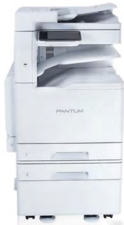
PANTUM China (A3/Color) CM420ADN